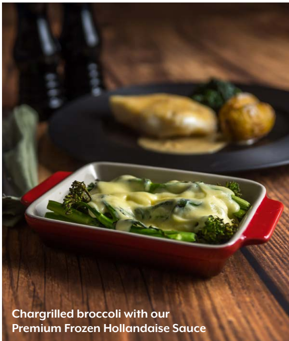
Chargrilled broccoli with our Premium Frozen Hollandaise Sauce