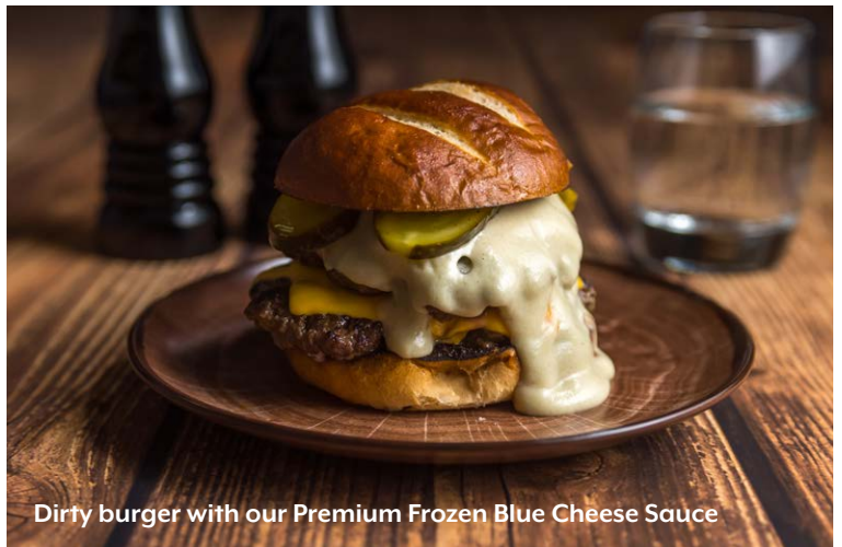
Dirty burger with our Premium Frozen Blue Cheese Sauce