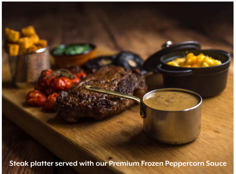
Steak platter served with our Premium Frozen Peppercorn Sauce